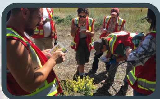
Education Programming 10%