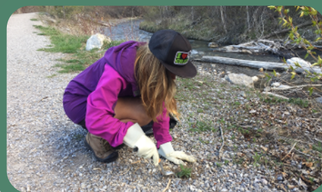
Invasive Plant Management Programming 78%

Full financial summary available upon request