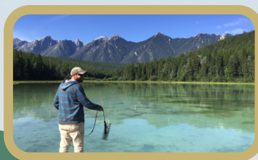
Aquatic Programming 2%