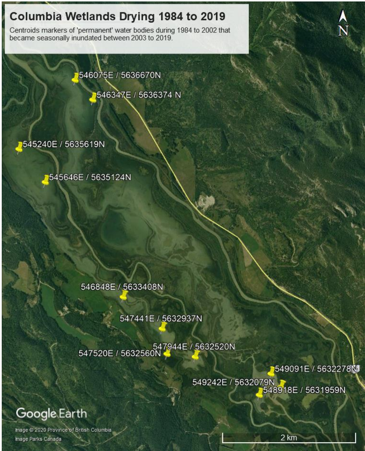
Figure 1. Map of 11 Columbia Wetlands between Brisco and Spillimacheen, BC that have lost permanent open water in the period 2003-2019 compared to the period 1984-2002.